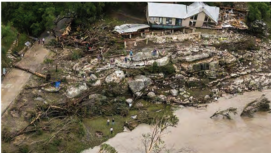
In May, flooding in Texas destroyed this home. The average utility pole is 45 foot tall and flood levels reached 43 feet. Imagine flooding like this in our area.