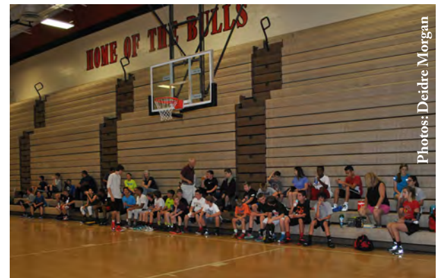
Campers take a water break after drills.