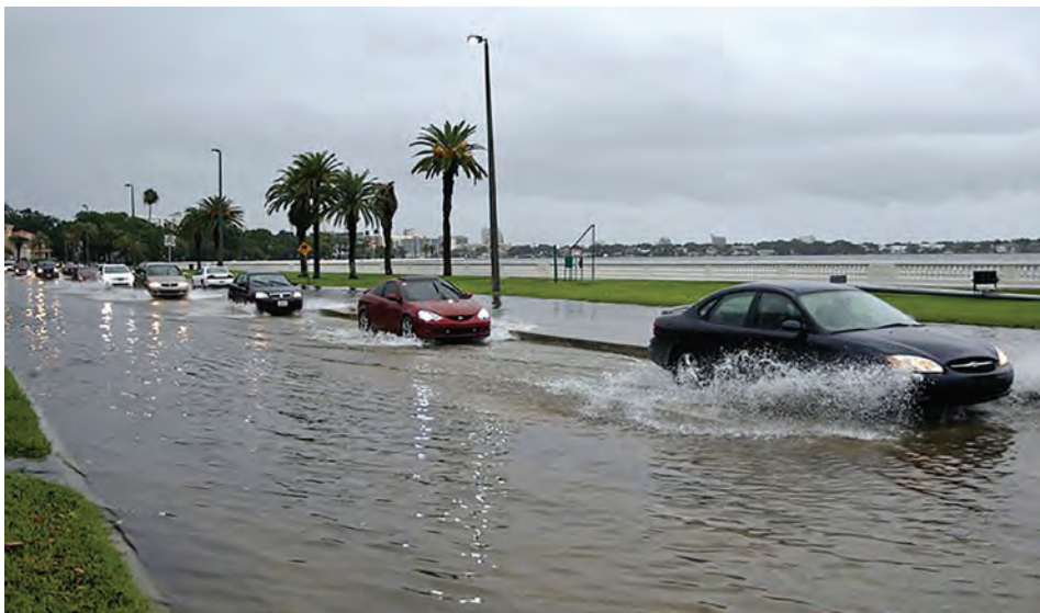
Recent flooding in Tampa on Bayshore Avenue was some of the worst in many years. Some Bloomingdale residents who work at MacDill AFB were caught in this storm.

Many of us saw last month just how dangerous and destructive even flooding can be in our area. Get prepared – now!