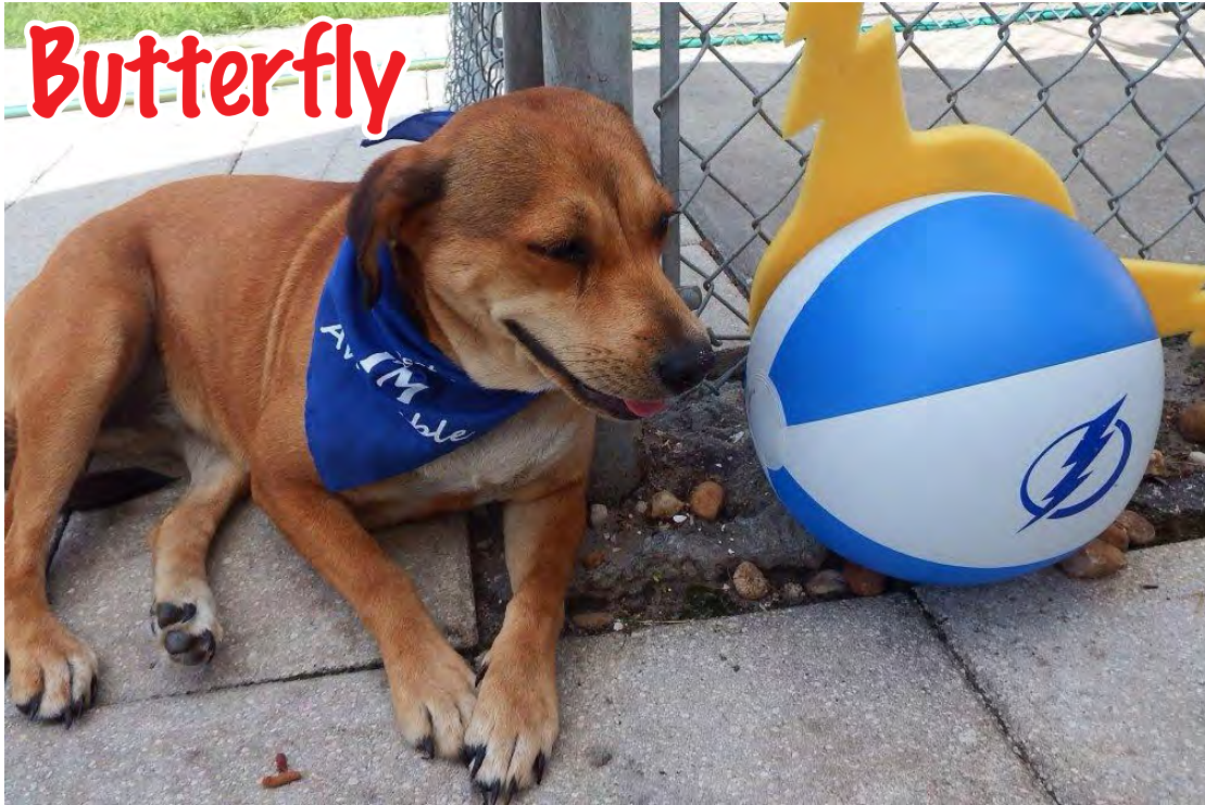
Butterfly, a lovable 3-year old medium-sized hound arrived at the shelter with an unusual eye condition that caused her eyelashes to grow in the wrong direction. She has since received corrective surgery and is ready for a loving family to take her home. Can that be you? Adopt Butterfly, ID# 27998139, so she can spread her wings and fly!

For information on adoptions and foster care, lost pets or spay/neuter vouchers, contact the PRC at (813) 744-5660 or visit www.HillsboroughCounty.org/Pets . Located on Falkenburg Rd., the center is open daily from 10 a.m. to 7 p.m.