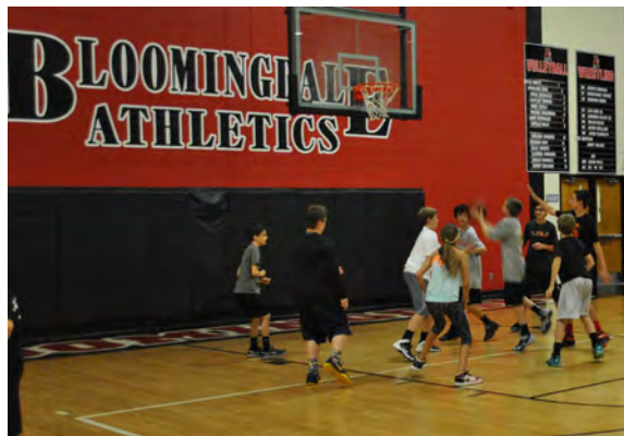
The campers put their skills to the test with drills.