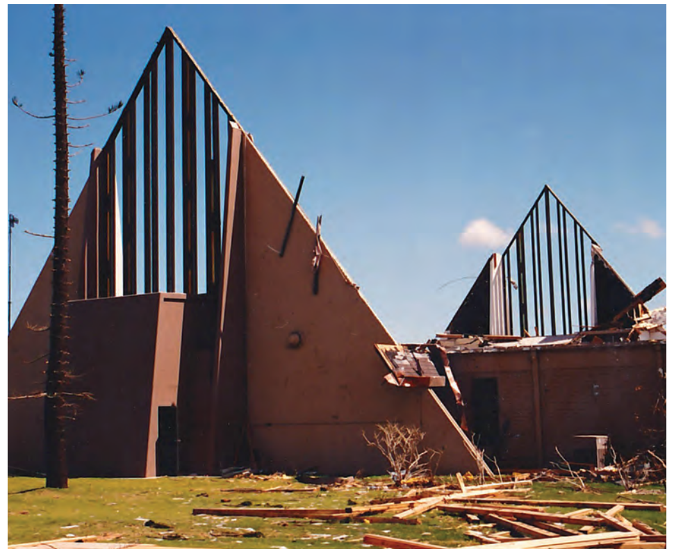
This is all that is left of the base chapel on Homestead Air Force Base after Hurricane Andrew hit the base in 1992, a “quiet” hurricane season.

So, please, take the time now to prepare. It only takes one major disaster to change your lives forever.