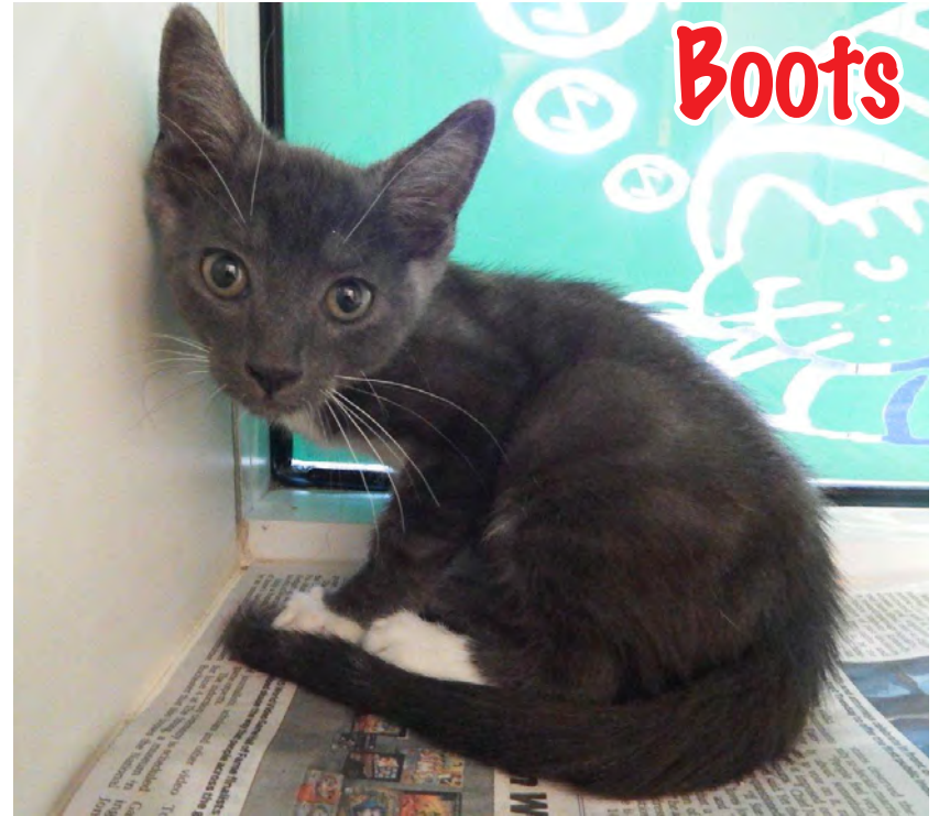
Boots is an all gray boy with itty-bitty white socks. After a shaky and sickly beginning, he's now 2-months old and up for adoption to a fabulous home. After living the stray life, Boots is a little nervous, but with a gentle hand and reassurance, he morphs into a purr-machine in no time. Adopt Boots, ID# 2775009; he needs some lovin'!