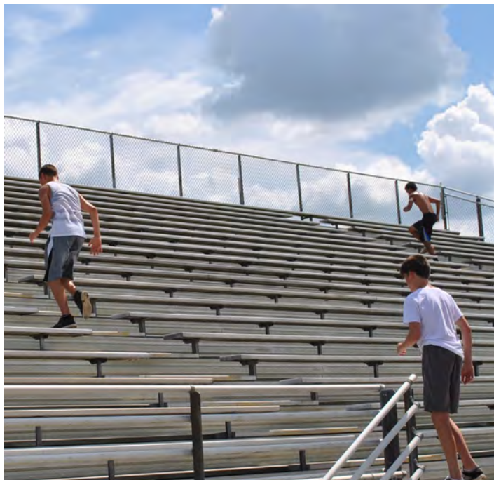
Even in the Florida heat, players run “bleachers” as a conditioning drill.