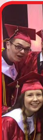
BSHS Am (f