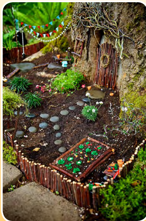
Need inspiration? Check out The Magic Onions at http://www.themagiconions.com . Each year this group hosts a Fairy Garden contest from April to August. Pictured is the 2014 winner.