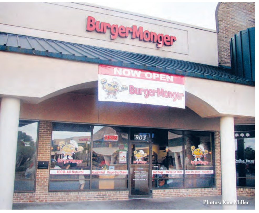
Burger Monger opens in Bloomingdale Plaza.

For more information about Burger Monger and their menu visit www.Burgermonger.com.