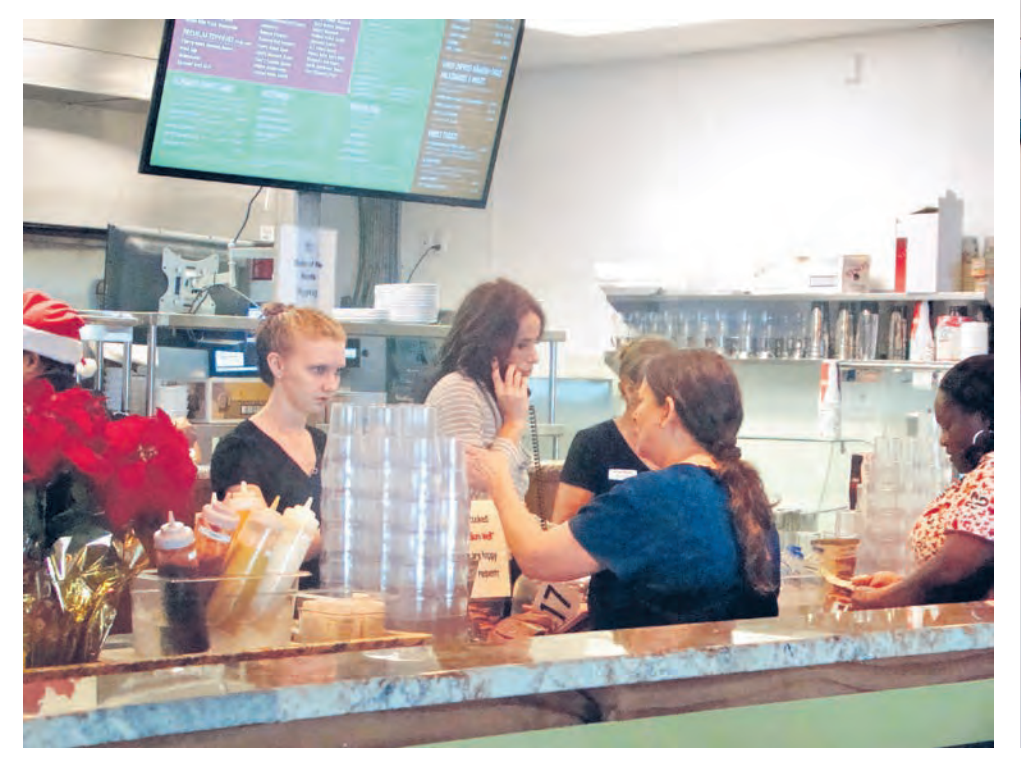
Customers line up to order freshly custom-created burgers.

Burger Monger serves 100% pure Akaushi above USDA prime Kobe beef burgers and hot dogs. Their menu includes a variety sandwiches, salads, and serves all-natural chicken breast sandwiches. Sandwiches, hot dogs, and burgers can be topped with 25 of the free toppings offered. Of course the best side to any burger or hot dog is French fries, and Burger Monger's fries are freshly cut and fried to order. To accompany those great fries and burgers, Burger Monger offers Haagen Dazs milkshakes and malts, refillable soft drinks, as well as wine and beer for the adults.