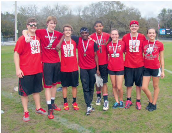
Tournament Champions - Can't Touch This.

The February event did not raise as much money as students had hoped, but at the end of the day, all of the teams had a great time, and the event promoted awareness for the well being of our nations veterans. The National Honor Society is planning on hosting another event at the Ice Sports Forum in March to raise more money for the Wounded Warrior Project, if you would like to support them, or attend, please contact Bloomington High School or keep checking the Bloomington High school website.