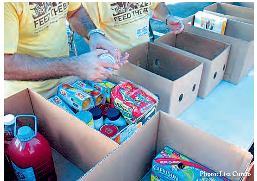
Feed the Bay comes to the Bloomingtondale/Valrico area every Spring to collect non-perishable food items for food pantries all over Tampa Bay. Visit your local Publix, Sweetbay or Walgreens on March 23 to participate.

For more information or to volunteer, visit www.feedthebay.org .