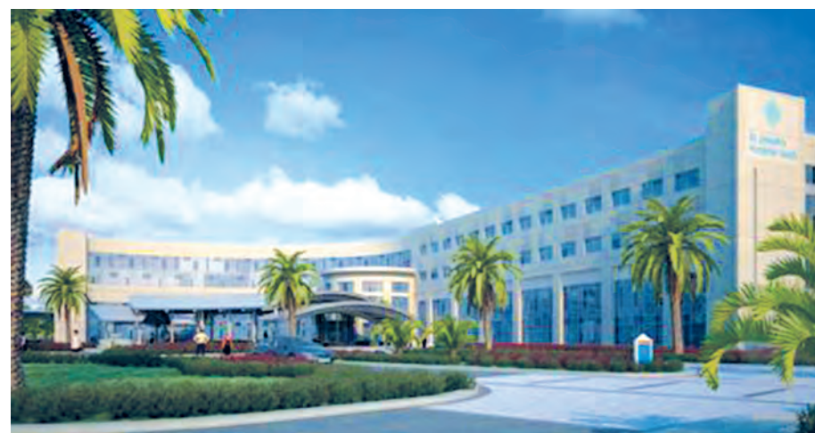
The new St. Joseph's Hospital-South is scheduled to be completed in 2015.

Those thinking of selling have reason to be optimistic! On average, Bloomingdale saw a 10.91% increase in purchase prices between the months of January and July for both 2012 and 2013, and over the last two months we have experienced a 6.37% increase in price per square foot! The statistics* are promising and exciting, but also dependent on interest rates, local employment, and our overall grassroots effort. Until next month, please stay informed and involved as Bloomingdale can't be Bloomingdale without you!