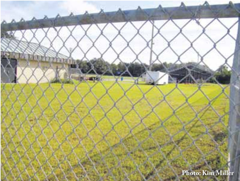
A new field house at Bloomingdale High is hoped one day to stand between the hospitality house and the tennis courts.

So, the question remains, "If they build it, will they come?" That will be up to the efforts of the administration of BSHS, along with support from the Bloomingdale community. Look for more information on how and when you can join the excitement by helping BSHS build a new Field House "One-Seat-At-A-Time."