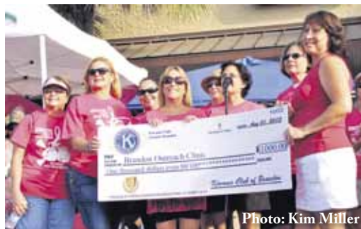
Brandon Outreach Clinic gratefully accepts check from Brandon Kiwanis Club.