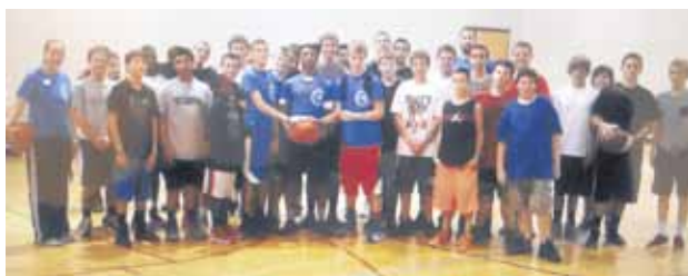
Twenty teens showed up to dribble their way to midnight in the second Friday Night Hoops event held by the Campo YMCA on Oct. 18.

The Campo Y plans on offering Friday Night Hoops (a.k.a. Midnight Basketball) about once every quarter starting in 2014. (Another one is not planned for the remainder of this year due to all the holidays.) The cost is planned to be the same: $10 for facility members/$15 for program members.