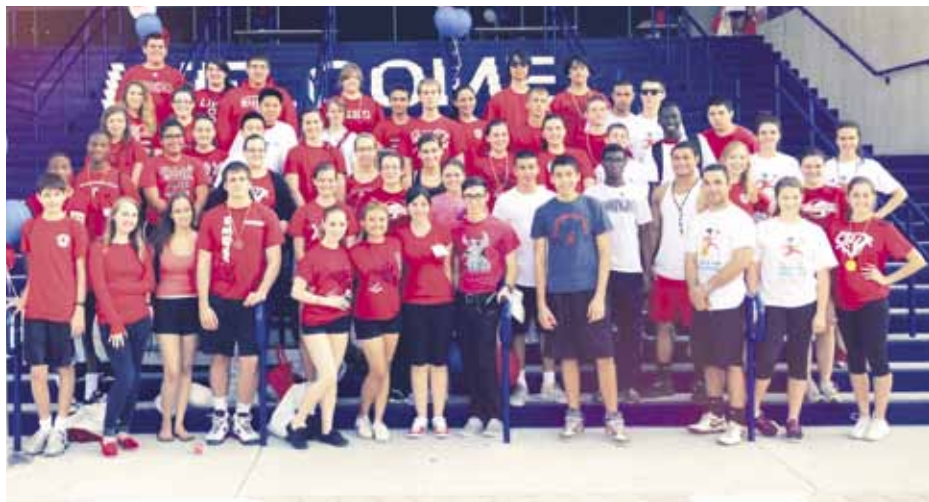
Bloomingdale High School student participants at 2012 Take Stock in Children's Strides for Education Tampa Bay 5K Scholarship Walk.

For more information visit the Bloomingdale High School Guidance Website ( http://www.bloomingdaleguidance.org/ ) and click on volunteer opportunities under Guidance Blog.