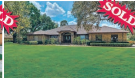
916 CENTERBROOK DR $519,000