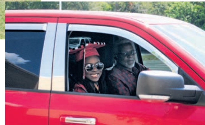
A Bloomingdale Grad waits her turn in line.