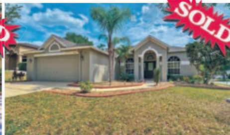
4501 COMPASS OAKS DR $314,000