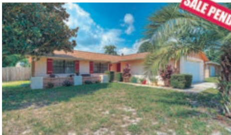
759 CALIENTE DR