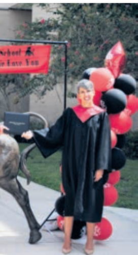
na. ne rocking their Covid couture.