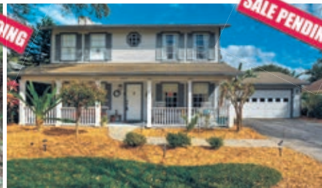
1445 MONTE LAKE DR