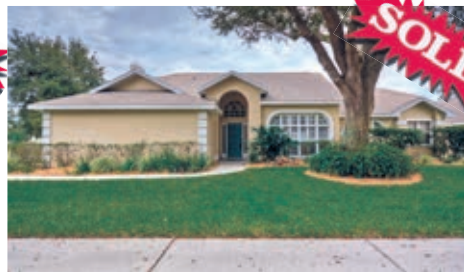
2302 TIMBERGROVE DR $359,000