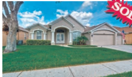
2230 GOLF MANOR BLVD $425,000