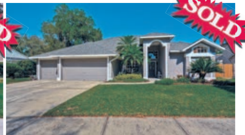
3603 WARMSRING WAY $380,000