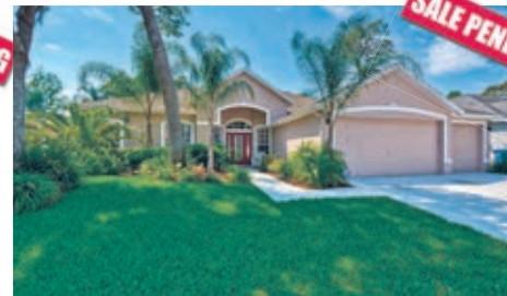
2523 CENTENNIAL FALCON DR