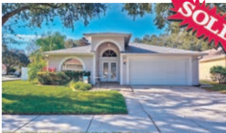
4503 PRESTON WOODS DR $290,000