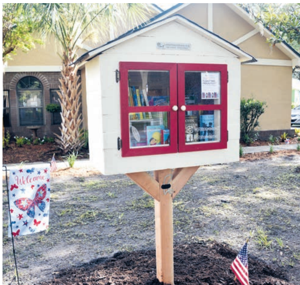
3811 Cold Creek Drive