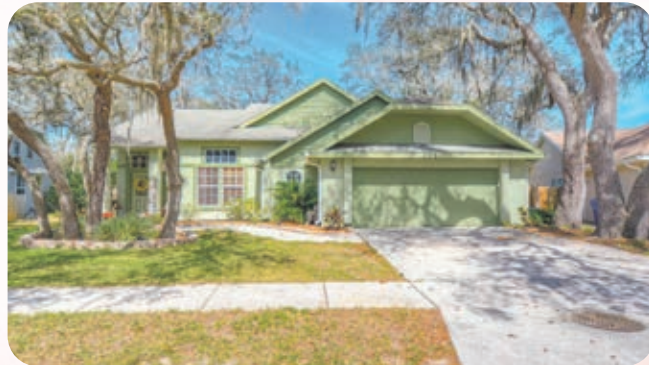
2412 Kenwick Dr