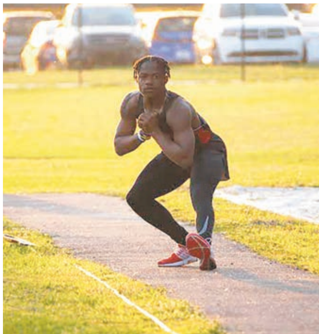
Bloomington Tri meet @ Bloomington (Bloomington, Armwood, Durant)