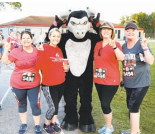
Cimino teachers and staff hang out with the BSHS Bull.

The ROTB 5k is made possible by local business sponsors, including Gold Sponsors Acropolis Riverview and Heroes Paradise. Registered participants receive a dri-fit shirt and finishers receive medals. The race is chip-timed by Fitniche Events and age group winners receive awards.