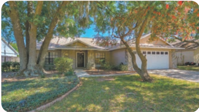
4410 Oak River Cir