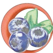
Bob's Berries, LLC

Below are a few local farms planning to open for u-picking this season. Visit the farms online or call to determine when picking will take place as the ripening of the berries is dependent on the weather conditions.