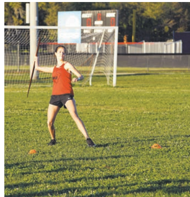
Bloomington Tri meet @ Bloomington (Bloomington, Brandon, Durant)