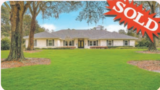
506 Centerbrook Dr