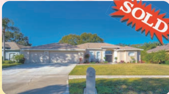
4407 Swift Cir