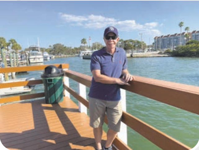
Visit Dunedin, one of the oldest towns on Florida’s west coast. It’s just one hour away and offers plenty to do for everyone.

Today, the Dunedin Pipe Band keeps that cherished tradition alive by performing around the U.S. and internationally representing Dunedin. From now until the end of April, you can hear members of the band perform on the pier Friday and Saturday nights at sunset.