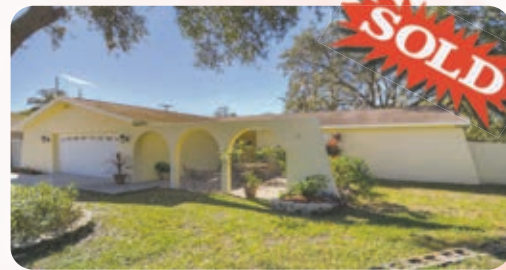
3701 Casaba Loop $290,000 15k OVER Asking Price