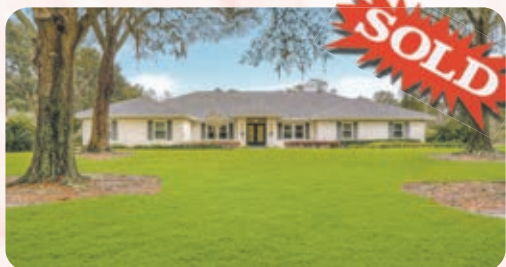
506 Centerbrook Dr $830,000 55k OVER Asking Price