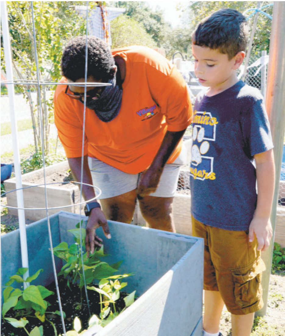
A member of the Village Early Learning Center staff interacts with a student.

Part-time day programs including VPK will begin in August for 3 and 4 year-olds. Classes will be offered in the morning with the after-school program meeting in the new building each afternoon. Full day programs, serving children 6 weeks through VPK, will still be offered in the original Village building.