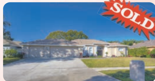
4407 Swift Cir $425,000

You want the BEST agent to get you TOP $ .