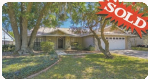
4410 Oak River Cir $347,000 7k OVER Asking Price