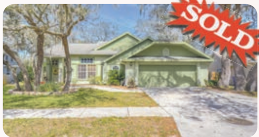
2412 Kenwick Dr $360,000