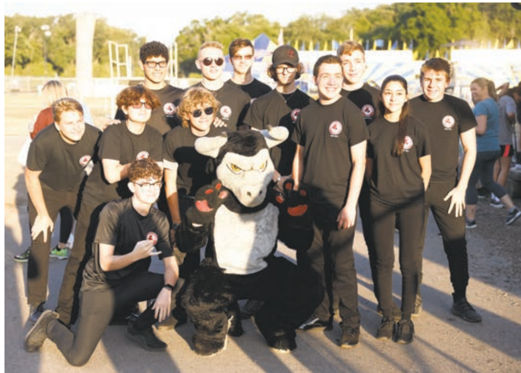
The Rajun Bull Drumline hangs out with the Bull before the start of the 4th Annual Running of the Bulls 5k.