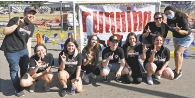
National Honor Society volunteers behind the scenes kept the event running smoothly.