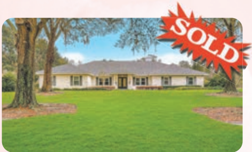
506 Centerbrook Dr $830,000 55k OVER Asking Price