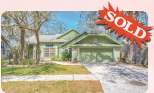
2412 Kenwick Dr $360,000