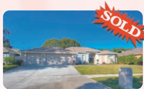
4407 Swift Cir $425,000