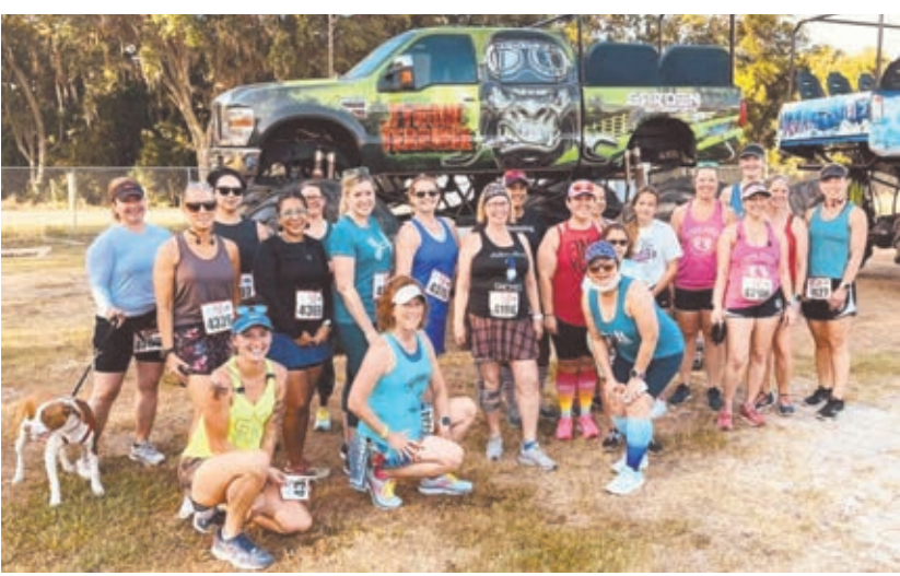
Monster trucks added a unique photo op for race runners!