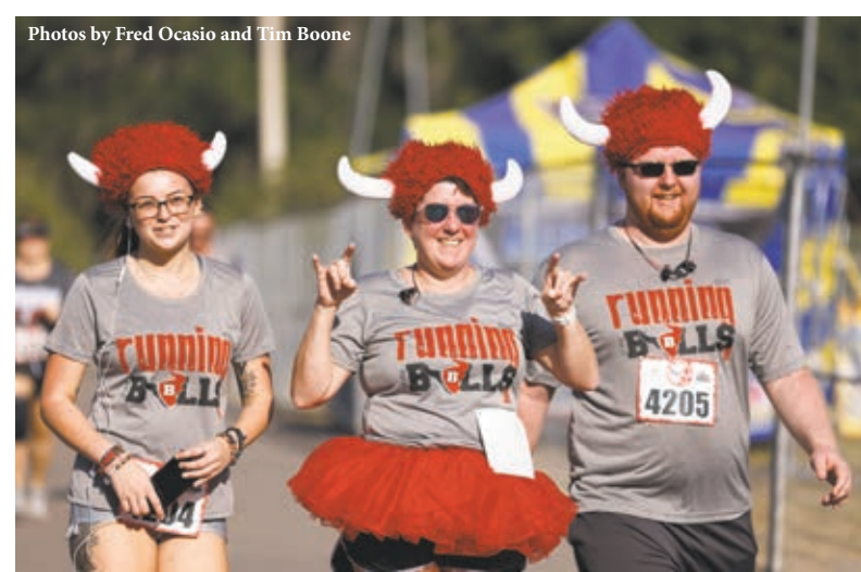
ROTB - The most fun you can have with your horns on!