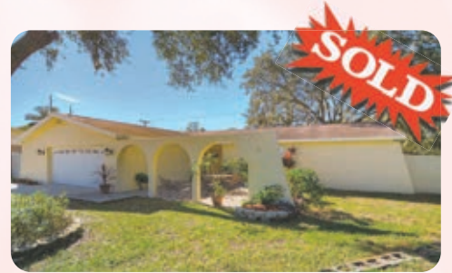
3701 Casaba Loop $290,000 15k OVER Asking Price