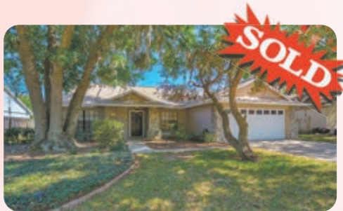
4410 Oak River Cir $347,000 7k OVER Asking Price