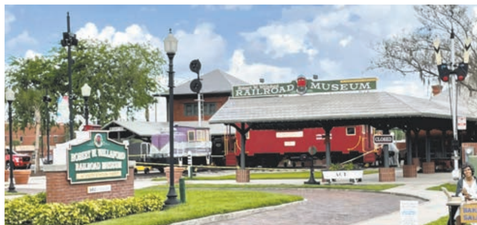
Visit the Robert W. Willaford Railroad Museum to learn about Plant City's rich train history.

Depot Antiques; 107 N. Collins St. 10 a.m.-5 p.m. Closed Sunday Rocking Horse Antiques & Collectibles; 114 N. Collins St. 10 a.m.-5 p.m. Closed Sunday Collins Street Junction; 117 N. Collins St. 11 a.m.-5 p.m. Closed Sunday Miss Ruby's Antiques & Collectibles; 119 N. Collins St. 10 a.m.-5 p.m. Closed Sunday Tracks to Treasures; 105 S. Collins St. 11 a.m.-5 p.m. Closed Sunday State Theatre Antiques; 111 W.J. Arden Mays Blvd. 11 a.m. Friday & Saturday Only The Mercantile; 208 S. Collins St. 10 a.m.-5 p.m. Closed Sunday & Monday