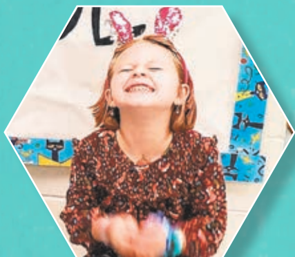
Aria Bailey Kindergarten, Alafia