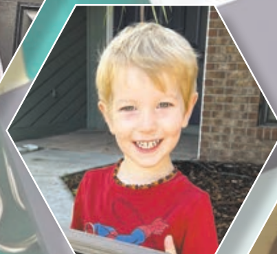
Nash Pre-school VELC