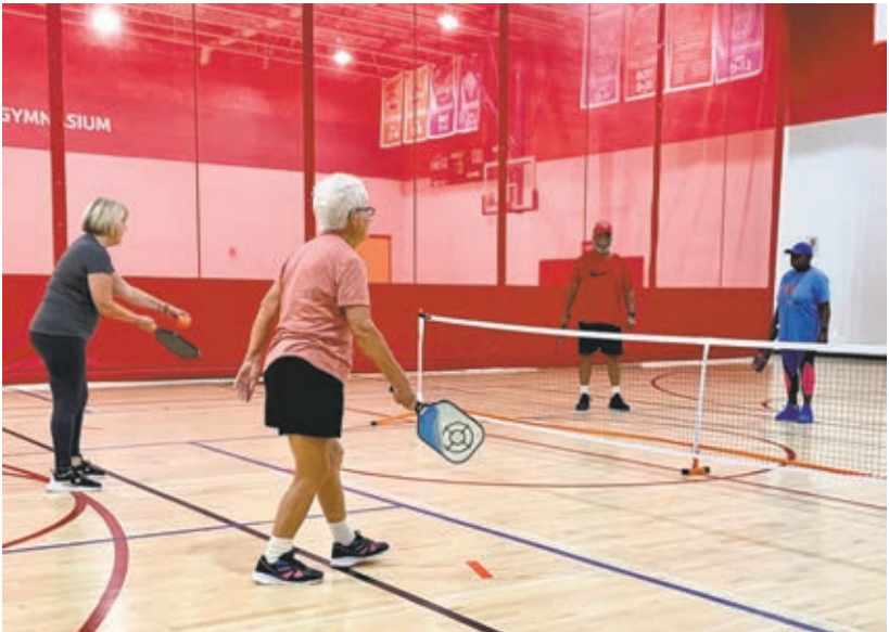
Beginners practice skills at a recent Pickleball class at Campo Y. Silver Sneaker and Y members over age 50 are welcome to attend on Tuesday's at 11 a.m.