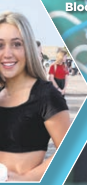
, 9th, o, 11th, gdale