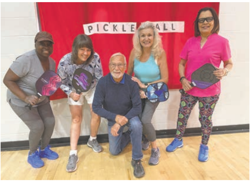
Players from last season's Beginner class.