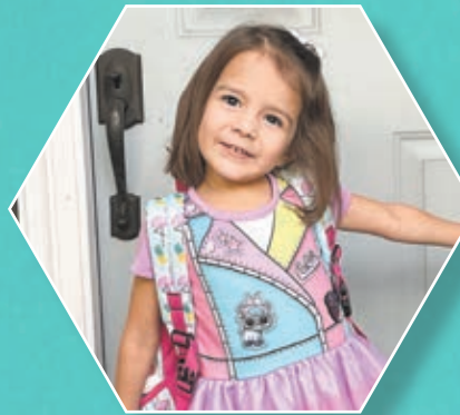
Emma Fravel Kindergarten, Alafia