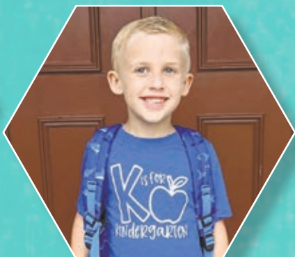
Malachi Kindergarten, Cimino