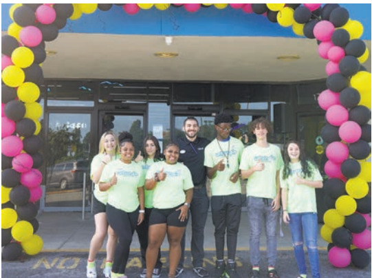
The staff of UrbanAir gathers for a quick group picture before the doors open to the excited crowd.