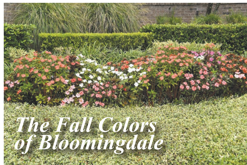
The Fall Colors of Bloomingdale