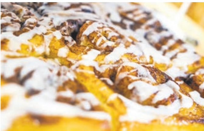
Fresh baked cinnamon rolls are one of Wingspread Farm’s most popular baked goods