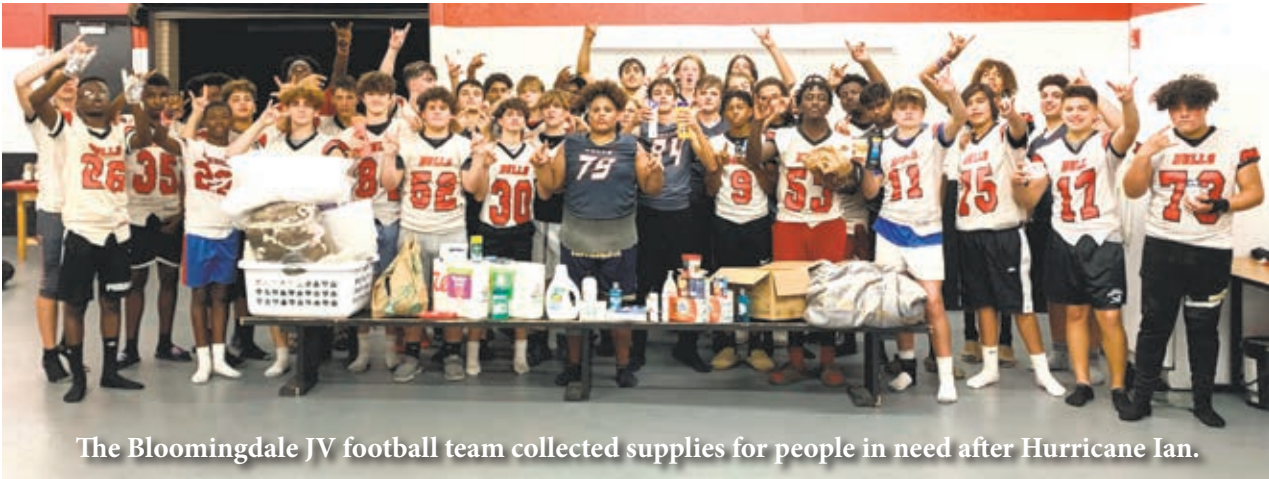
The Bloomingdale JV football team collected supplies for people in need after Hurricane Ian.