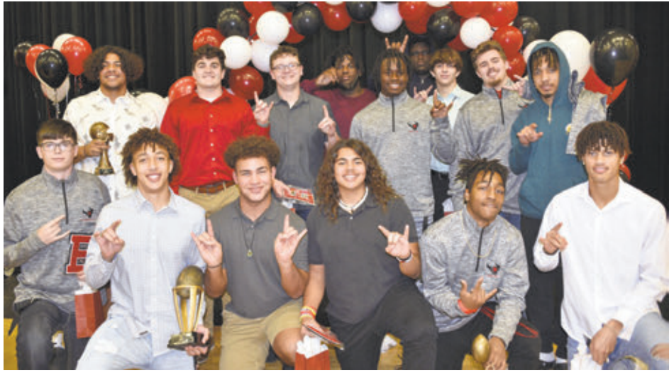
BSHS Bulls Football 2023 Seniors