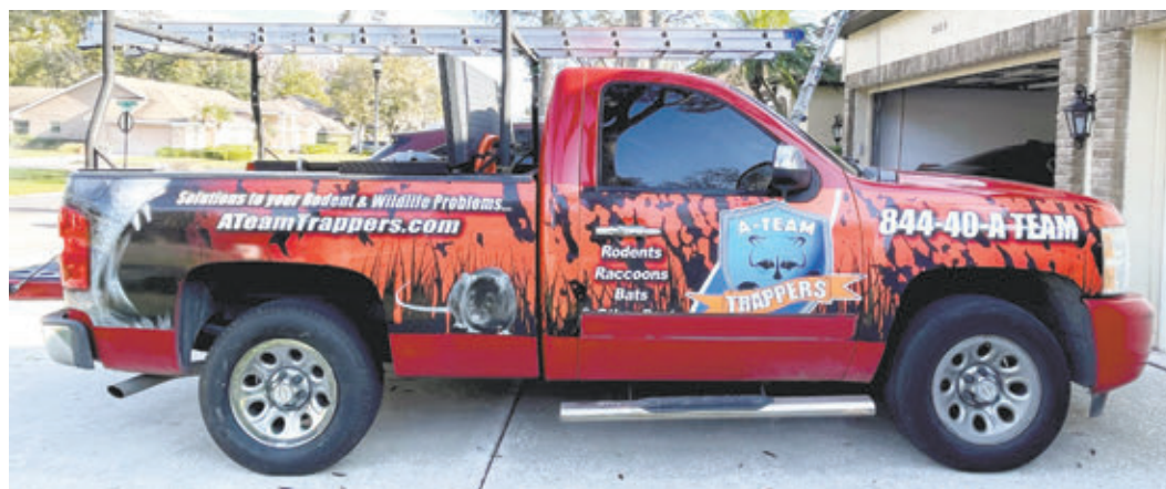
There are ways to protect your attic space from nesting raccoons while making sure the animals remain unharmed.