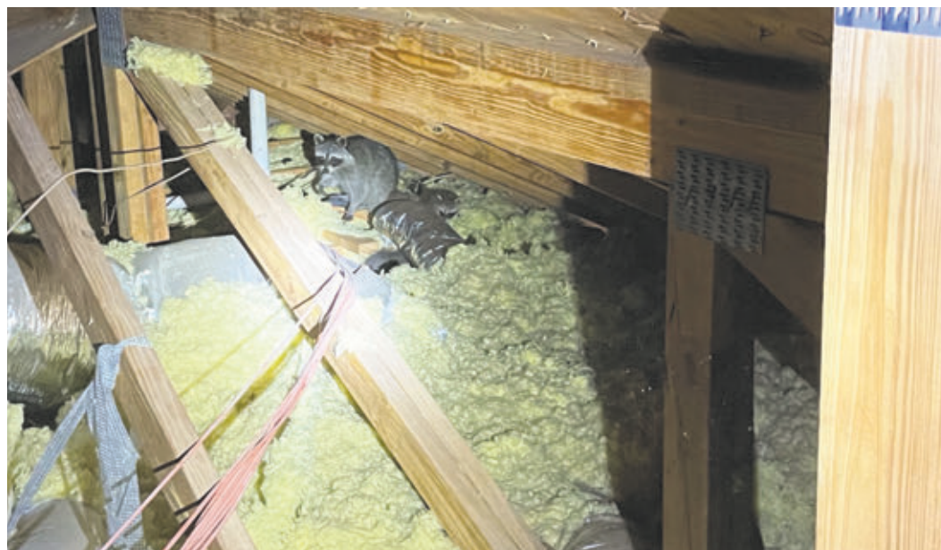
Roxie and one of her kits