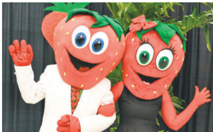
The Florida Strawberry Festival will take place from Thursday, March 2 through Sunday, March 12 in Plant City.

Learn about youth exhibiting the animals and plants they've been raising for months and even years. You'll see some of the finest livestock in the area and learn how the winners are chosen.