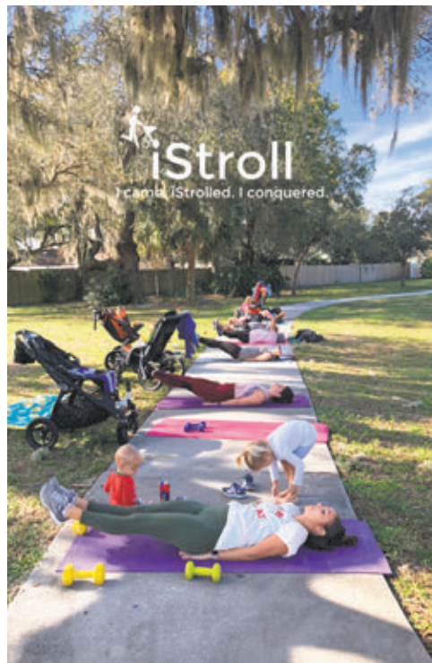
iStroll Brandon offers new moms a great way to work out with their children and meet other new parents.