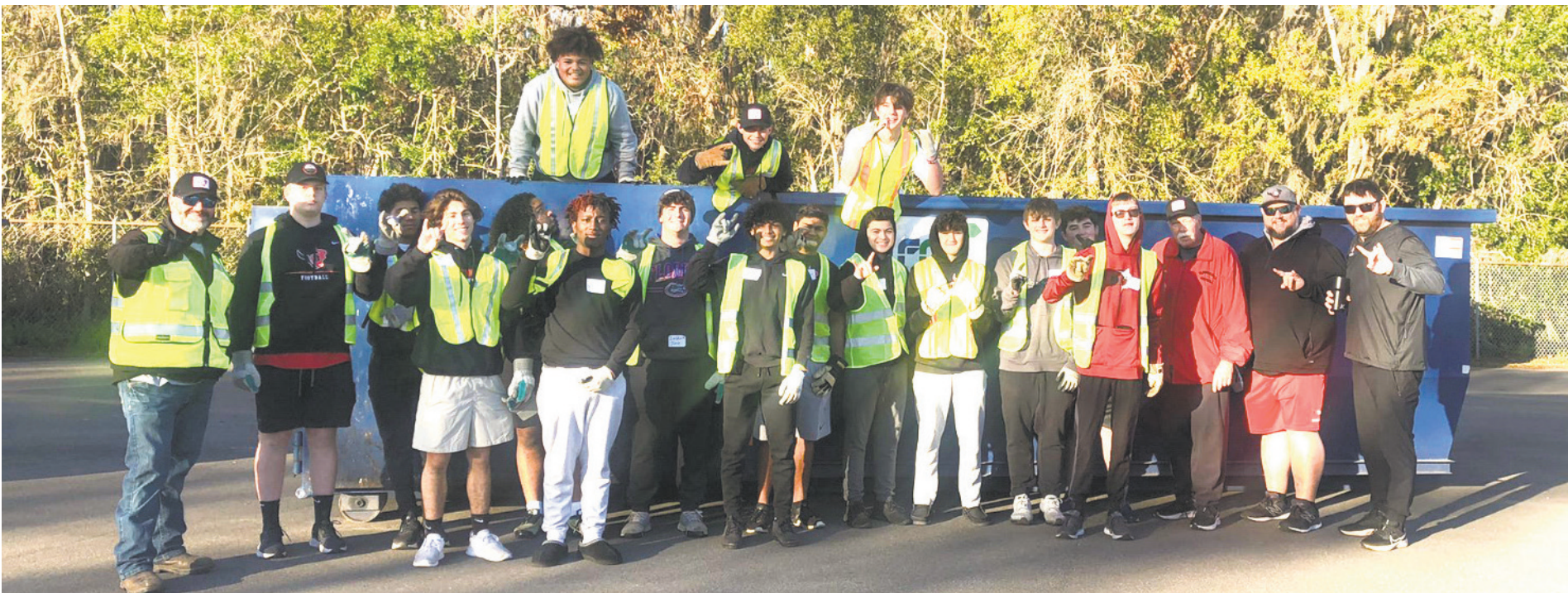
Football players from Bloomingdale High School helped residents remove items from their cars to place in the dumpsters at the recent Bloomingdale Cleanup Day.