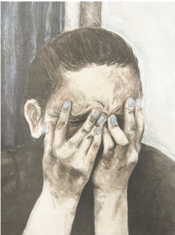
Watercolor and colored pencil by Elsie Owen