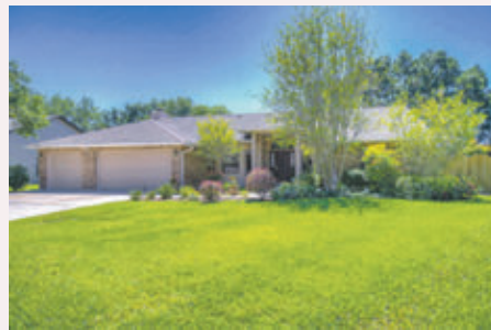
2830 TIMBER KNOLL DR