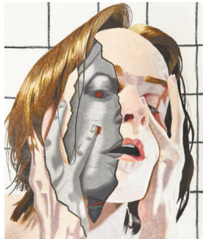
Watercolor and colored pencil by Christian Abrigg