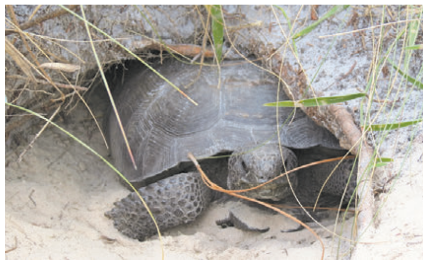
April 10 is Gopher Tortoise Day. Join Park Rangers at Lithia Springs Conservation Park for a 3.2-mile hike to learn about the tortoise's importance to our ecosystem.

Lithia Springs Park is located at 3932 Lithia Springs Rd. in Lithia.