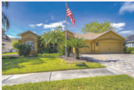
4303 GLENDON PL