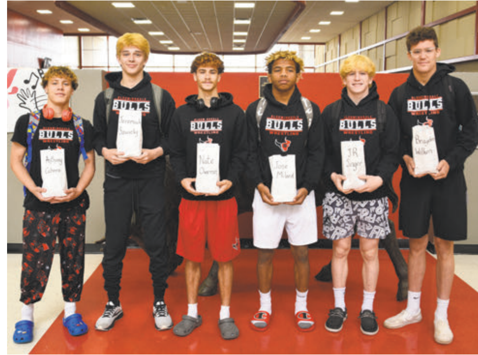
State Qualifiers at Bloomingdale High School before the State Championships