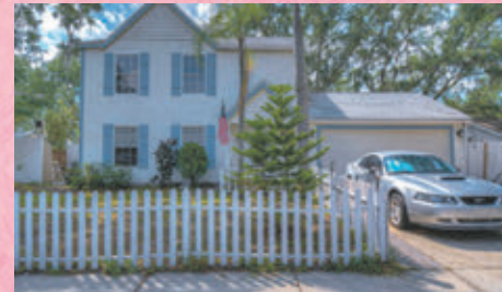
516 Emberwood Dr