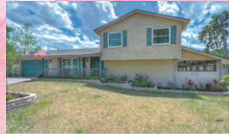
4007 Greenmark Ln