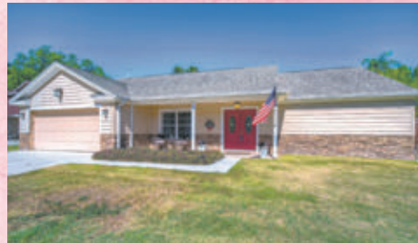
3707 Kingsford Pl