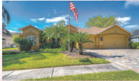
4303 Glendon Pl