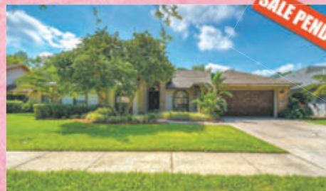
3816 Cold Creek Dr