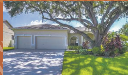
4405 BLANTYRE PL