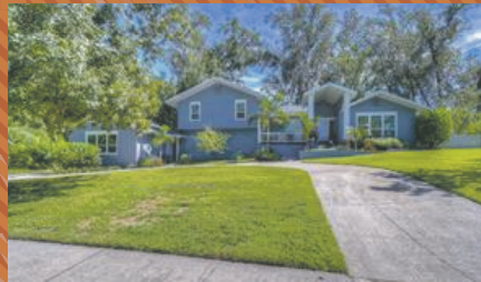
108 HOLLY TREE LN