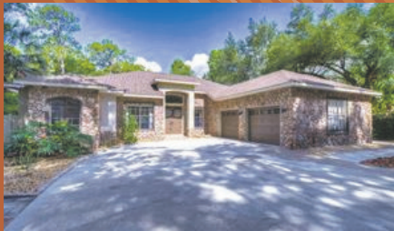
904 RIVER RAPIDS AVE