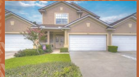
3612 SAVANNAH LAKE PL