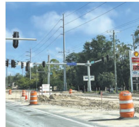
Construction on Bell Shoals has been ongoing since late 2018. Relief may be coming as the road is scheduled to be completed soon.