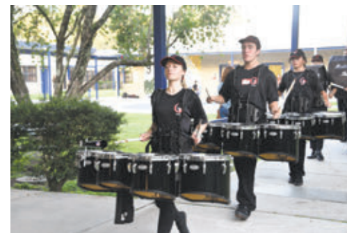
Alafia Kicks off Start With Hello Week with BSHS Drumline.

"Sandy Hook Promise "Start with Hello" week is designed to "Teach children and youth how to minimize social isolation, empathize with others and create a more inclusive and connected school culture". The second that Bloomingdale High School Drum Line began to play, there was an instant connection between the high school students and our elementary students. Students and staff came rushing from all over campus to watch them play. The best part was to watch former Alafia students as highly skilled percussionists, doing what they love as they were inspiring the next generation of musicians."