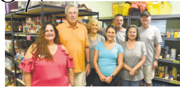
Bloomingdale Community/BNA Donates Food and $1369 to Seeds of Hope