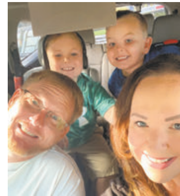
BNA Hires New Office Manager