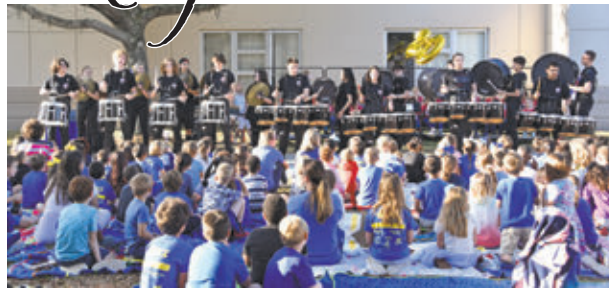
Cimino Elementary Celebrates 20th Anniversary