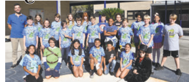
Alafia Elementary Starts New Drum Ensemble