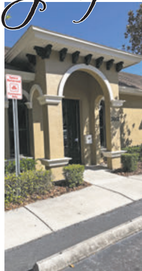
Bloomingdale Special District Moves Office