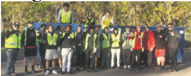
BNA Sponsored Clean-Up Day A Success