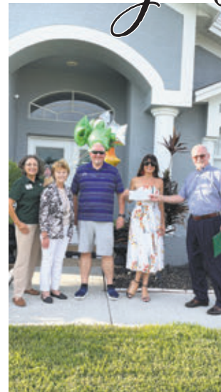
BNA Awards Residents $500 with Beautification Award