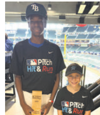
BYSA Players Compete at World Series MLB Pitch Hit & Run Event