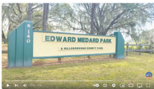
Mindful Mondays: Take a Tour of Edward Medard Park Hillsborough County 439 views 2 years ago For more tips and resources on mental health and wellness visit HCFLGov.net/MindfulMondays The Official Hillsborough County, Florida Government YouTube channel is powered by Hillsborough Television (HIV), find m... more

Interested in mindful videos that help improve your mental health? Check out the Mindful Monday's YouTube Playlist.