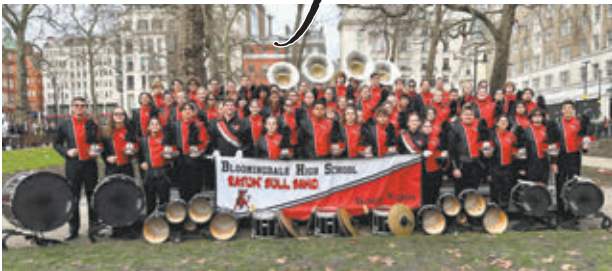
BSHS Music Department Performs in London New Year's Parade