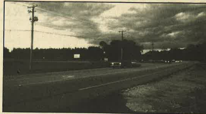
The proposed Lithia Pinecrest Road site, just south of Lithia Springs Elementary, within the Lithia community of River Hills.

The owners of the 5.9-acre Bloomingdale Avenue site offered to donate an additional acre of land to the county free of charge, bringing the available acreage up to 6.9 acres at a cost of $265,000. The commissioners asked the county real estate department to document the offer. The 4-acre Lithia site is being offered to the county for $550,000.