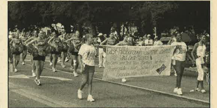
Bloomingdale and Brandon High students combined forces as the East Hillsborough County Summer Band and Drill Team to march in Brandon's 4th of July parade last month.