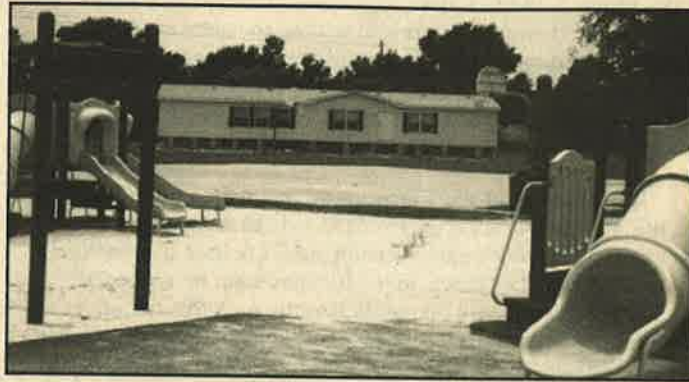
The location of the new park deputy's residence at Bloomingdale West Park will allow him to keep an eye on every area of the park including the playground, fields, recreation center and wooded areas.

Further announcements and meeting dates will be posted on our community web site, BloomingdaleOnline.com.