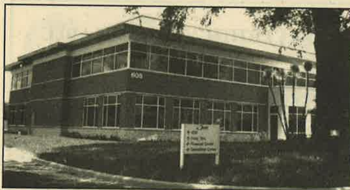
The new MacDill Federal Credit Union (MFCU) Operations Center is now open for business.

The commission is tentatively scheduled to make a final ruling on the site choice at their September 5 board meeting. Additional public hearings to gather residents' input may be announced this month. Meeting dates and announcements will be posted on Bloomingdale's community web site, BloomingdaleOnline.com. The BHA urges all Bloomingdale residents in support of the Bloomingdale Avenue library site to e-mail the county commission at hillsboroughcounty.org/mail/email.html, or call (813) 272-5660 for commission phone and fax numbers.