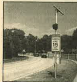
Drivers going through school zones must slow down, especially around Alafia Elementary. No warnings will be given.

Traffic laws require cars traveling in both directions on roads without a dividing median to stop for school buses. This applies to Bloomingdale Avenue. Slow down and give yourself enough distance from other vehicles, including school buses.