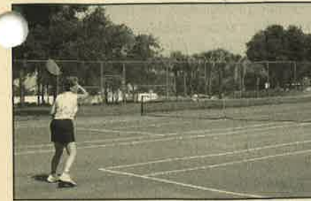
The park's four tennis courts will be recoated and restriped this fall.

maintenance jobs at the park, including recoating and re-striping the tennis courts, replacing some of the court fencing and repainting the racquetball courts.