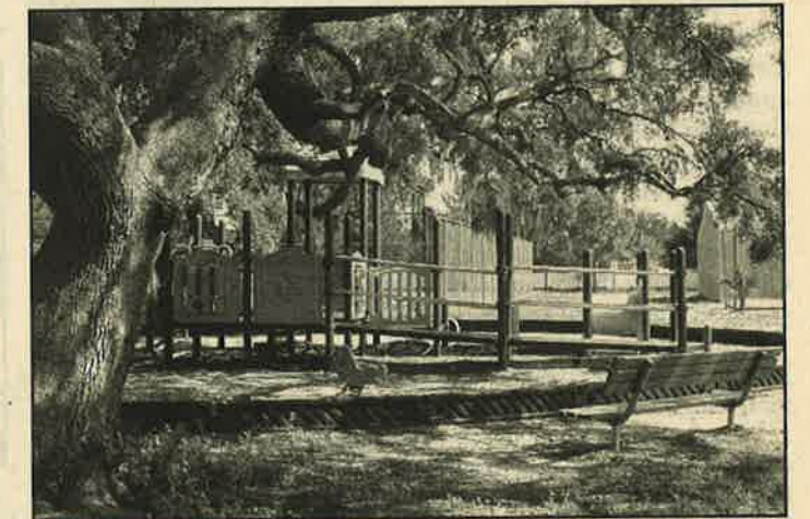
Play equipment and landscape curbing was recently added to the playground at Bloomingdale East Park.

Homeowners with ideas for improvements to the park are invited to attend the next BHA meeting on Monday, August 6 at 7:30 p.m., at the Bloomingdale Community Office, 3509 Bell Shoals Road. Residents may also contact the BHA with their ideas by calling (813) 681-2051, faxing (813) 651-1129 or by e-mailing frazier1@tampabay.rr.com.