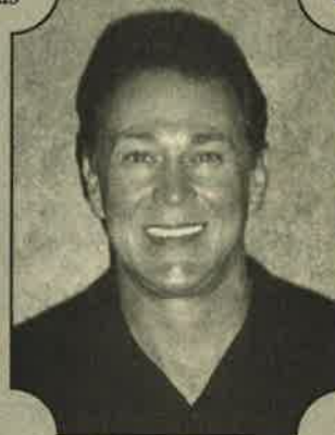
See us at our new facility at : 410 W. Bloomingdale Ave.