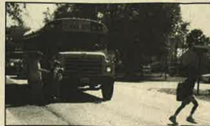
Traffic laws require cars traveling in both directions to stop for school buses.

metts. Hundreds of kids and adults are seriously injured each year, some critically, because they weren't wearing a twenty-dollar helmet. Helmets are a smart choice for bike riders of all ages.