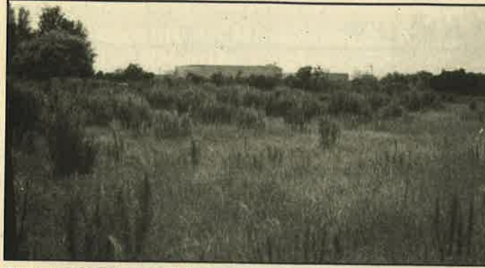
The proposed Bloomingdale Avenue site, just east of Bloomingdale Senior High in Valrico.