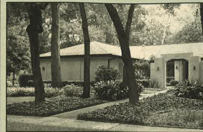
The Foreman's Dogwood Hills yard

This month's winners each received multiple nominations from their neighbors. Both received a $20 gift certificate from