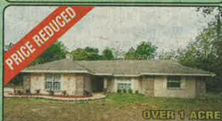
OVER 1 ACRE