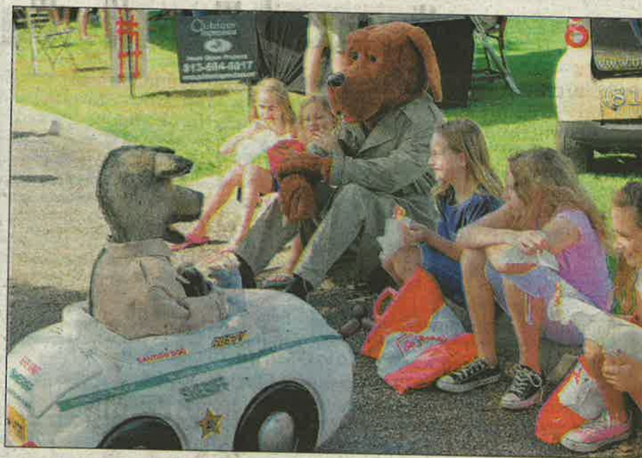
HCSO Crime Dog and his co-partner "Rusty" found a place in the shade to talk to Bloomingdale children about how important it is to "Take a Bite out of Crime"

The event was free to community members, and throughout the day, more than 600 people flowed through Family Fest enjoying all the activities. Visits from local fire and sheriff's departments, hula hoop contests, balloon artists and even a putting contest hosted by the Bloomingdale Senior High School Cross Country team were just a few