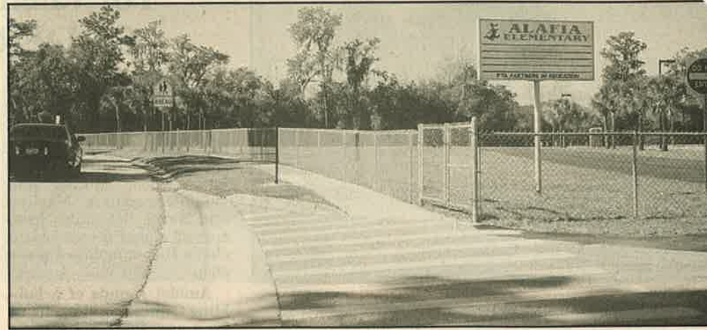
New traffic patterns have improved traffic flow around Alafia Elementary School. Changes to improve the parking situation are being studied.

No vehicle is allowed to enter at the gate located nearest to the intersection of