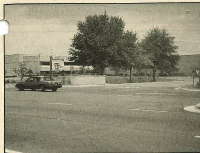
Several months have passed since council members were told a traffic light would be installed at the east entrance to Bloomingdale High as soon as a technical issue was solved by TECO. The traffic is very congested, so please slow down until the signal is installed.