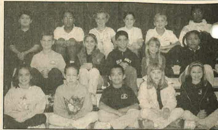
Photos from Cimino Elementary School