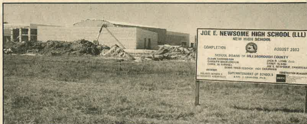
Bloomingdale residents have closely been following decisions made concerning the boundaries for the new high school located off Fish Hawk Blvd.

Deputy Maurer noted several community entrance areas that serve as school bus stops had been vandalized.