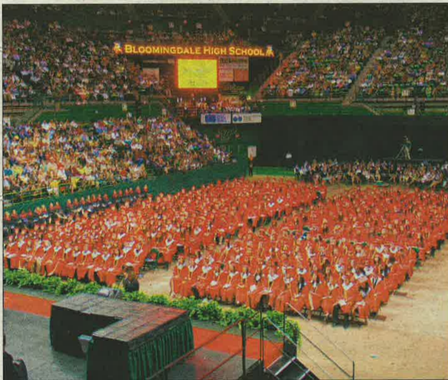
Bloomingdale High School Class of 2010 Graduation at USF Sun Dome June 9th.