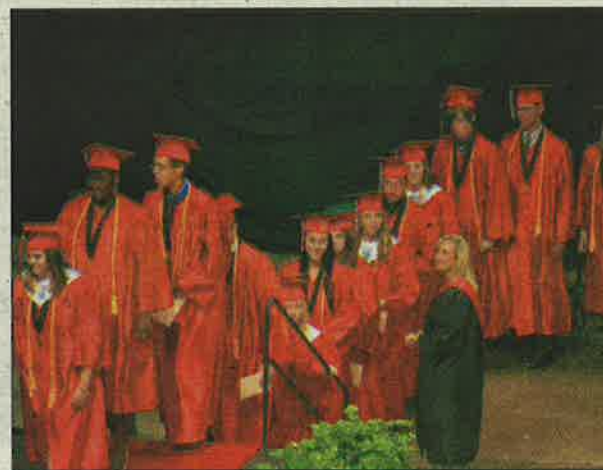
Bloomingdale High School seniors line up and awaiting that final walk to receive their diplomas