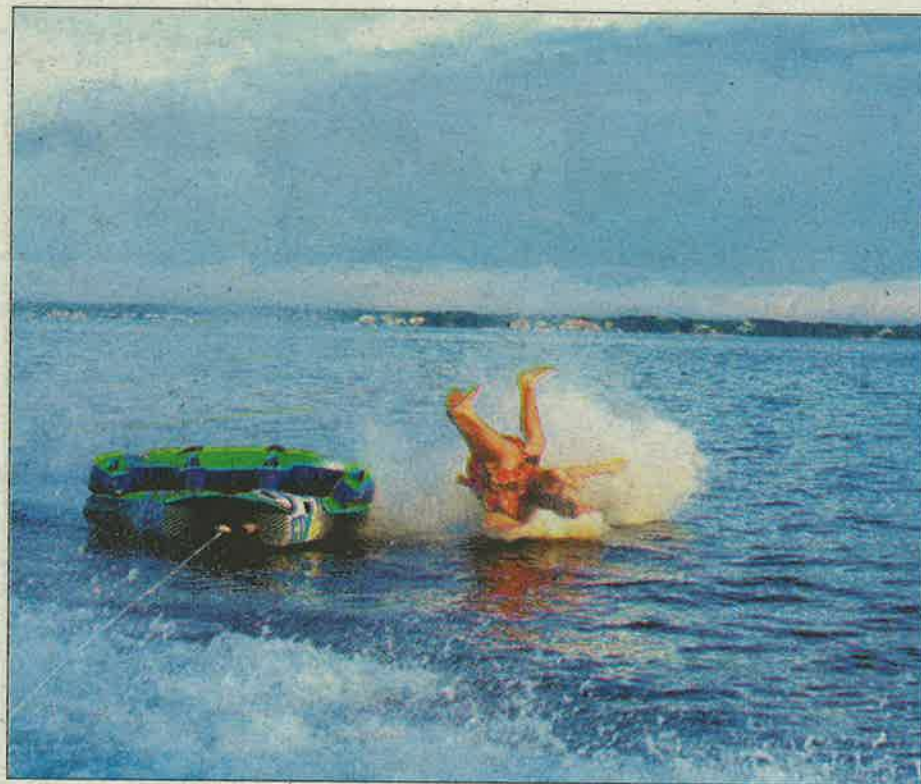
Mind you, sometimes the best day of fun ends with a splash!