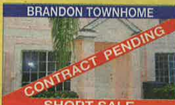
BRANDON TOWNHOME This amazing deal is perfectly located in the heart of Brandon close to shopping/dining/schools and a short drive to the interstate... Home is in a gated community and offers 2 bedrooms and 2.5 baths with all appliances to stay! Super clean and screened lanai!

Call Kesia today for a private tour... 813-240-3855