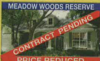
MEADOW WOODS RESERVE This David Weekley built home is gorgeous. Custom decorator touches everywhere with granite countertops in the gourmet kitchen and baths. Hardwood floors throughout, upgraded light fixtures and more... in huge lot.