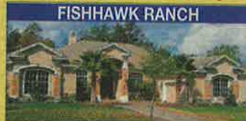
FISHHAWK RANCH In the gated Tern Wood... Custom Built by John C. Fowke... honeycomb ceiling//2 outdoor living areas with outdoor fireplace//granite in the amazing chef's dream kitchen//wood floors... and so much more... $799,900

Your Short Sale Experts Call Kesia today...240-3855