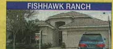
FISHHAWK RANCH This home has tile and wood laminate and sits on an oversized conservation lot - Open floorplan with formal living/dining and family room $189,000

Call Kesia today for a private tour of this home and come and enjoy the FishHawk Ranch life~813-240-3855