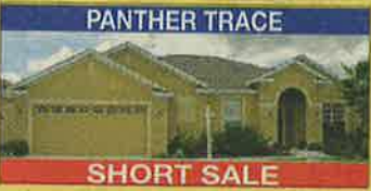
PANTHER TRACE 4/3/2 with over 2700 sq. ft. living area--SHORT SALE... WE ARE THE SHORT SALE EXPERTS! below market... Call us today to get the best deal in this market... $225,000

Don't miss this custom executive home... Call Bethany today 813-404-0567