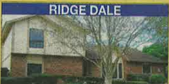
RIDGE DALE Completely remodeled home in Valrico... Location/Location/Location 4/3, 5/2 with heated pool/spa and 2 outdoor living areas with outdoor kitchen. $299,900.