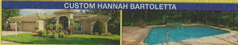
CUSTOM HANNAH BARTOLETTA FishHawk Ranch in the gated Eagle Ridge in the Oaks... 4/3/3 with over 3800 sq. ft. living area plus full outdoor kitchen for more living space and those great summer parties... Sitting on private conservation and cul-de-sac... The perfect home walking distance to Bevis Elementary... Hardwood floors and custom tile... All secondary bedrooms are roomy with large closets... This home is the most exceptional value that FishHawk Ranch has to offer...

Call Kesia today for a private tour... 813-240-3855