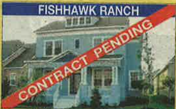
FISHHAWK RANCH David Weekley Sparta with fireplace, wall unit, Cambria countertops - short sale - $299,900 CAN CLOSE QUICK!!!!

Call Bethany today for a private tour 813-404-0567