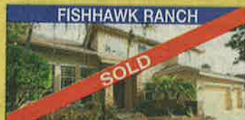
FISHHAWK RANCH Jaegergen/Sabal Built home on private wooded lot//Heated pool/spa//Formal living/dining/downstairs family room and upstairs bonus room//plus office//huge laundry room with cabinets and countertops and sink//custom faux paint throughout

Call Bethany Ezell today 813-404-0567 for this amazing value in FishHawk Ranch