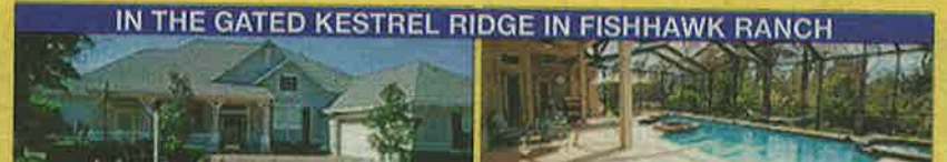
IN THE GATED KESTREL RIDGE IN FISHHAWK RANCH This custom built Tylermont by David Weekley is loaded with upgrades to include personal sauna in upstairs bath off office/bonus room... 4/3, 5/3 with over 4200 square feet... Sitting on over 1/3 private conservation lot... Sports lap pool with 15x15 sports area plus 10 person spa and gas/real wood firepit... Custom paint and decorator touches throughout...

Call Kesia today for a private tour... 813-240-3855