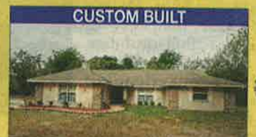
CUSTOM BUILT Sitting on over 1 acre//Over 2400 sq.ft.//Large open family room with fireplace//Screened Lanai overlooking private backyard-Fully Fenced with Electronic Gate

Call Kesia today for a private tour of this home and come and enjoy the FishHawk Ranch life~813-240-3855