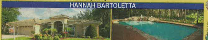
HANNAH BARTOLETTA Custom built home sitting on private conservation lot with oversized heated pool/spa** 4/3/3 with over 3800 sq. ft.** Home is Model Perfect** custom window treatments and decorator touches** Granite in the ultimate chef's dream kitchen** Barrel Tile Roof** Too many upgrades to list...

Call Kesia for details and private tour of this amazing home in FishHawk Ranch 813-240-3855