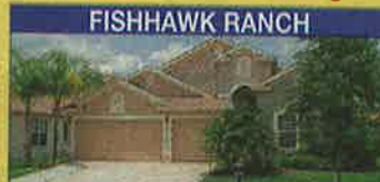
FISHHAWK RANCH Home in the gated Martin Meadow... New Hardwood floors throughout home and stairs-bonus room with closet-Over 2800 sq. ft.-4/4/3- This home is gorgeous! Art niches and custom paint throughout!