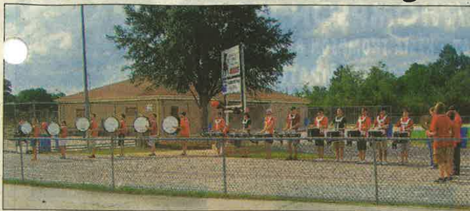
The drumline performs.