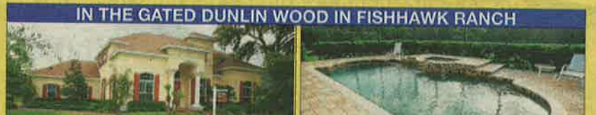
IN THE GATED DUNLIN WOOD IN FISHHAWK RANCH This custom built Nohlcree home is loaded... Over 3900 sqft living area with 4/3, 5/3 plus huge bonus room with closet and loft area plus office and formal living and dining room... Hardwood floors and chef's dream kitchen with tons of 42" cabinets and granite in the kitchen and all bathrooms... Home sits on private conservation lot overlooking pond... Heated pool/spa with brick pavers...

Don't miss this custom executive home... Call Bethany today 813-404-0567