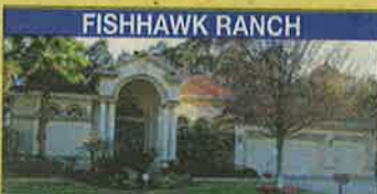
FISHHAWK RANCH Another Custom Hannah Bartoletta home in the gated Eagle Ridge backing to private wooded lot-heated pool/spa with outdoor kitchen-huge kitchen with open floorplan-over 3100 square feet 4/3/3.

Call Kesia today for a private tour and you will be amazed at the value...813-240-3855