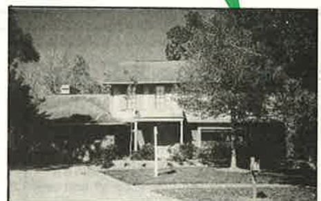
3421 BLOOMINGDALE OAKS CT BLOOMINGDALE OAKS $129,900 FOUR BEDROOMS, 2 1/2 BATHS, 2,305 SQ FT, SCREENED POOL

REACH FOR THE FIVE-STAR ADVANTAGE! CALL LUANA!