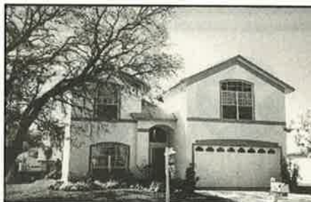
2313 LYNCREST COURT OAKCREST $129,900 CENTEX BUILT FOUR BEDROOMS, 2 1/2 BATHS, 2,039 SQ FT, SCRND POOL