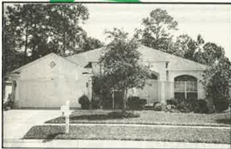
3732 HOLLOW WOOD DRIVE WINDSOR WOODS $149,900 LENNAR BUILT FOUR BEDROOMS, 2 BATHS, 2,214 SQ FT