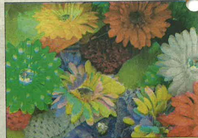
Colorful handcrafted items, like these headbands, abound at Gumballs & Overalls in Valrico.