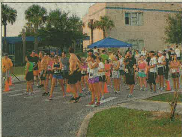
Running with the Bulls 5K run is about to start!