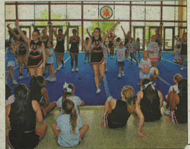
Bulls cheerleaders teach local girls cheers, chants and dance at mini bulls clinic! Pictured below, Bulls Cheerleaders are excited about teaching young girls about cheerleading!