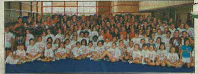
Bloomingtondale Cheerleaders with their Mini Bulls Cheeleaders!