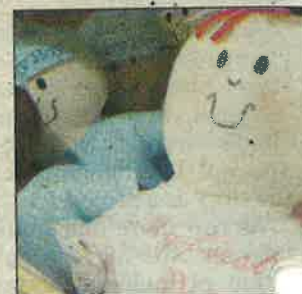
Shoppers can browse for handmade dolls and toys at Gumballs & Overalls in Valrico

"It's been a good name because it just sticks," Hicks said. "People either remember gumballs or overalls."