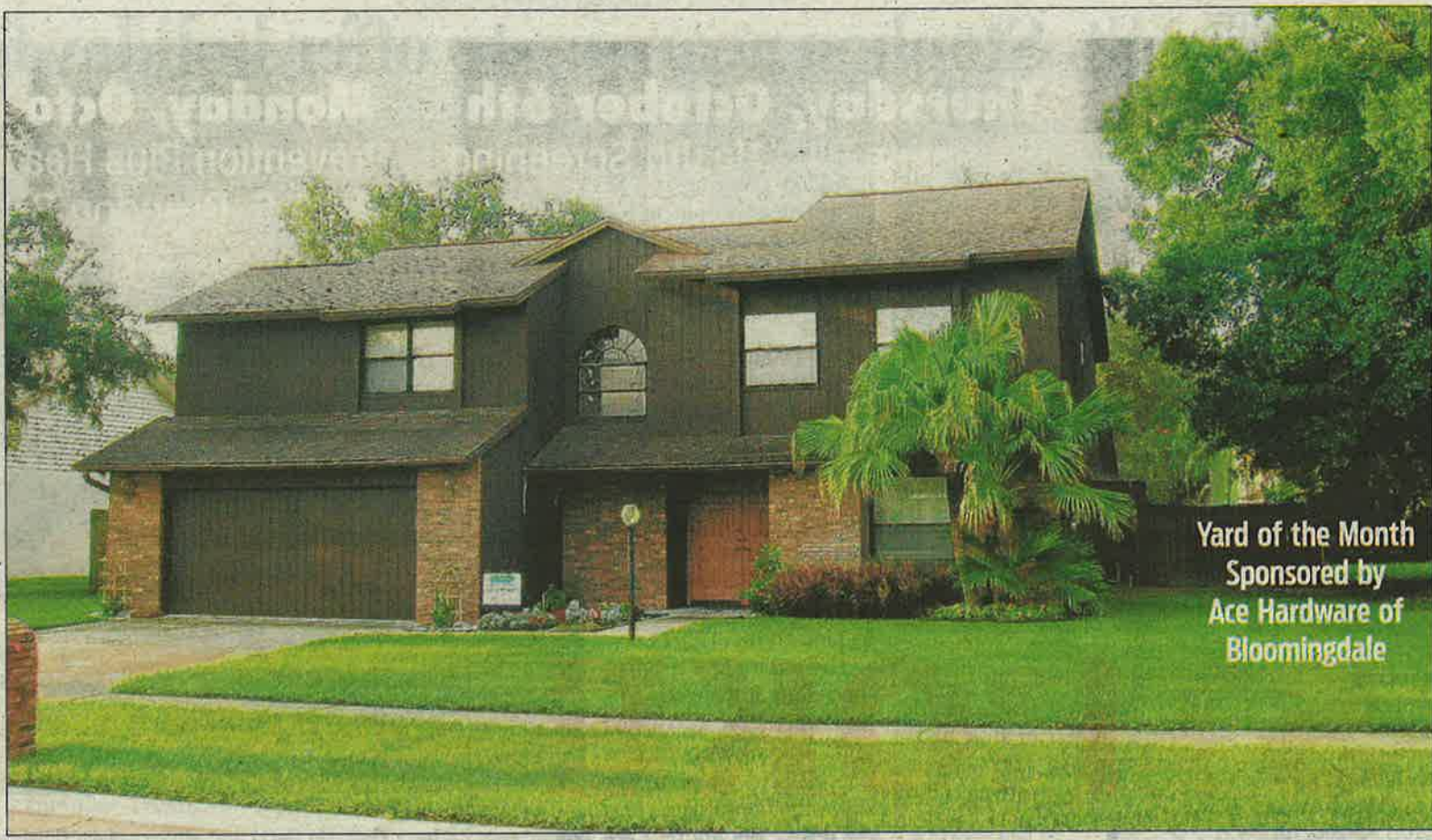
Yard of the Month Sponsored by Ace Hardware of Bloomingtondale