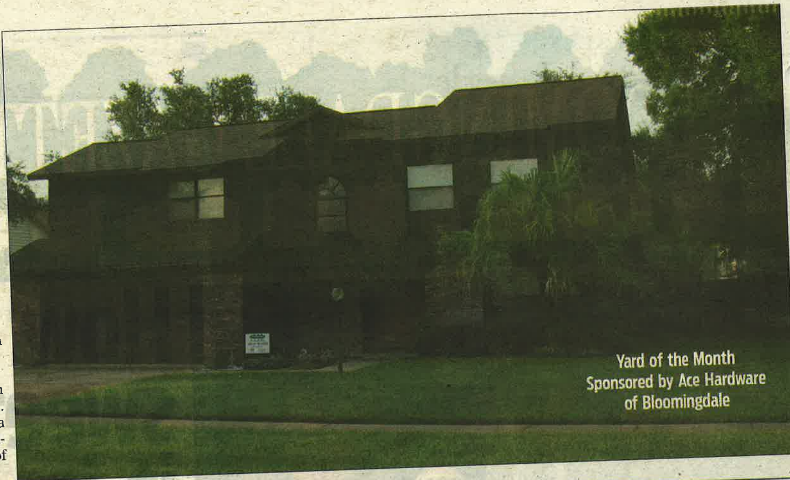
Yard of the Month Sponsored by Ace Hardware of Bloomingdale

Send Yard of the Month nominations to Inbloomingle- news@tampabay.rr.com or call (813) 681-2051. Winners will receive a $25 gift card redeemable at Ace Hardware of Bloomingdale.