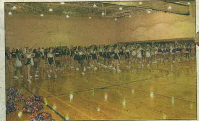
All teams participating in the NCA Camp at UF!