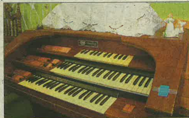
This Wurlitzer organ was part of an eclectic assortment of sale items at Back by Demand Thrift in Bloomingdale.

She said the couple chose Bloomingdale for