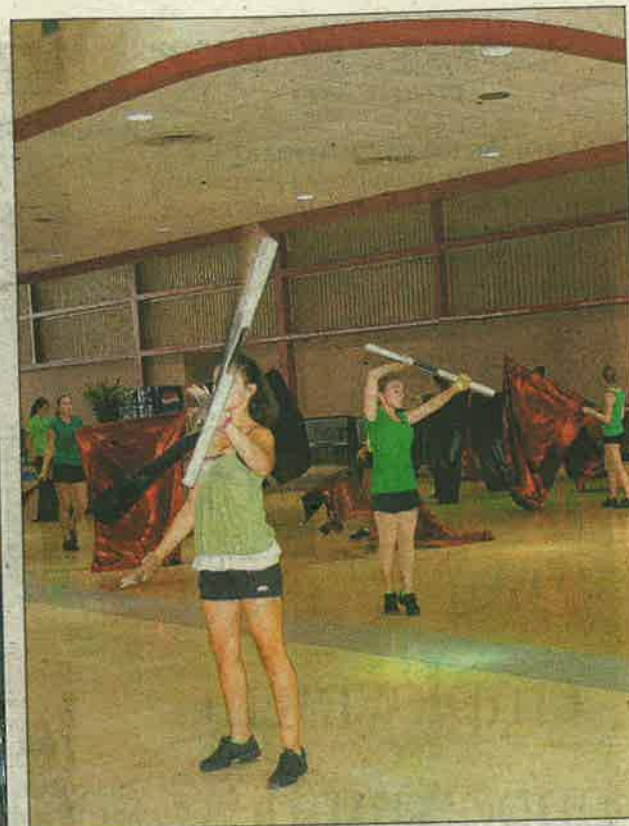
Crimson Guards are practicing very hard during camp with the Bloomingdale Band.