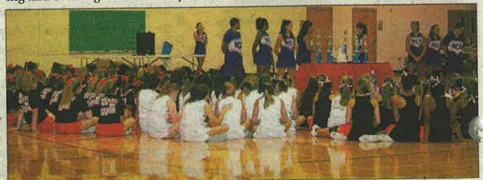
Award ceremony last day of camp!

Team. There were several girls from Bloomingdale that were picked for showing superior a display of all-around technique during the NCA camp. The four days of camp were a lot of hard work and fun for our girls. Needless to say the week was a huge success!