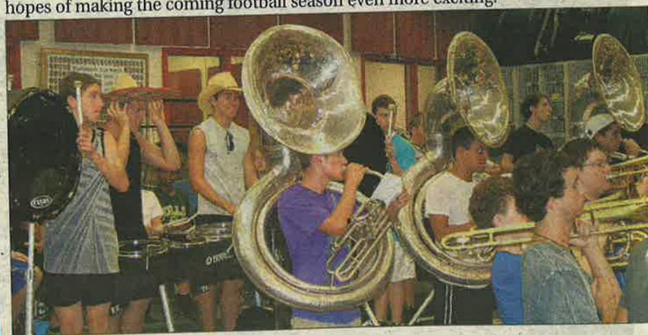
The drums and tuba are having fun at camp!

Bloomingdale Band is ready to go for the 2011-2012 school year, working hard to make this year another great year. They've made a few tweaks to their lineup, too, in hopes of making the coming football season even more exciting.