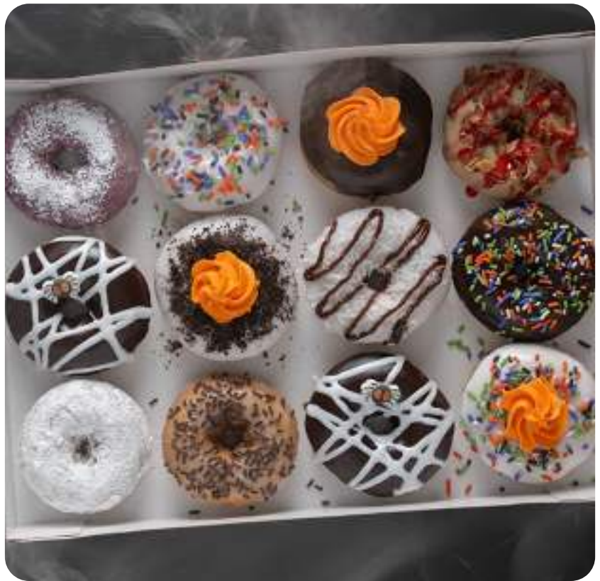
The Spooky Box, available for a limited time.

Duck Donuts specializes in warm, delicious and made-to-order donuts. Customers can create their own donut combination by choosing from a variety of coatings, toppings and drizzles, including traditional favorites such as chocolate icing with sprinkles and more adventurous creations such as maple icing with bacon. The family-friendly stores offer a viewing area where children and adults alike can watch their donuts being made. Duck Donuts also sells coffee, espresso beverages, donut breakfast sandwiches, donut ice cream sandwiches, milkshakes and offers online ordering. To learn more about local promotions or locate the nearest Duck Donuts, visit duckdonuts.com/locations/ .