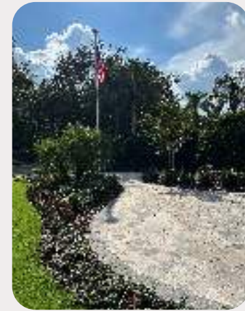
The new park is pictured here. Completed in installments, current progress on the park looks beautiful from all angles.