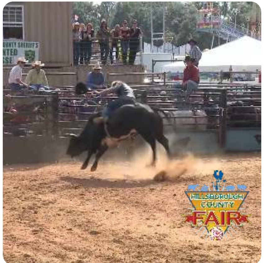
The 2024 Hillsborough County Fair will run from Thursday, October 31 to Monday, November 11. The Fairgrounds are located at 215 Sydney Washer Rd. in Dover.