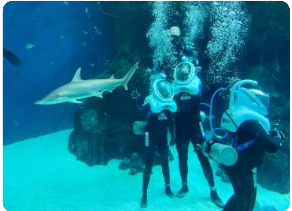
The author, on her recent visit to the Florida Aquarium, enjoyed the SeaTREK Helmet Diving Adventure, exploring 15 feet below the surface in the Heart of the Sea Habitat.